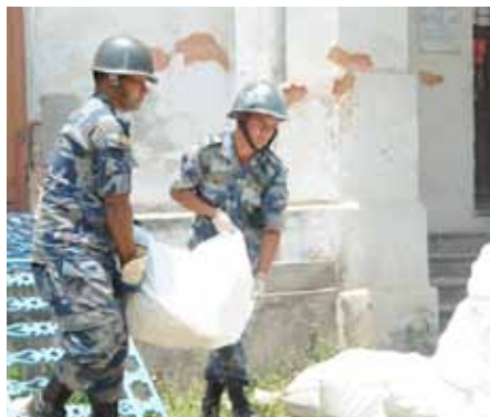
The personnel of Armed Police Force shifting the materials from the damaged building of the NHRC Central Office at Lalitpur

The technicians from the Housing and Urban Development and the Security Agency have tagged the red sticker considering the office damaged buildings unsafe. The Commission has, therefore, temporarily set up its office at the Child Care Center of the Commission while the daily work of the National Judicial Academy, Personal Records of the Government and Nepal National Library has remained completely dormant.