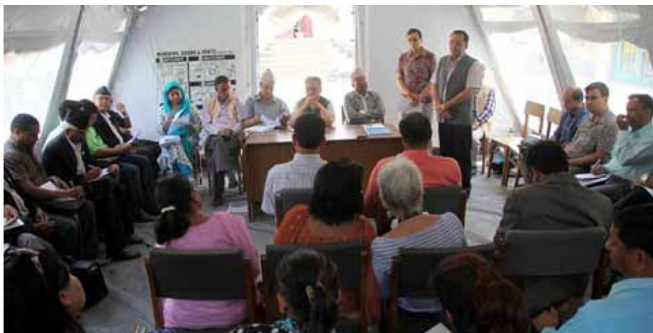
Acting Secretary Bed Prasad Bhattarai delivering the welcome address at a program organized to make public the preliminary report on the earthquake monitoring.

LALITPUR: The National Human Rights Commission has publicized the preliminary report on the on-the-spot monitoring conducted with regard to the loss of lives and properties, ongoing rescue work, relief distribution, rehabilitation including the overall human rights situation of the survivors of 14 earthquake affected districts.