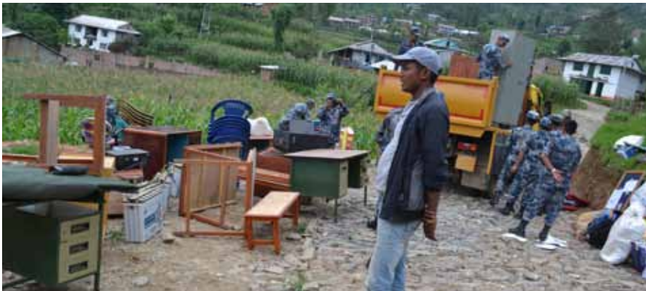
The office equipment of the NHRC Sub Regional Office, Khotang being shifted to a new location