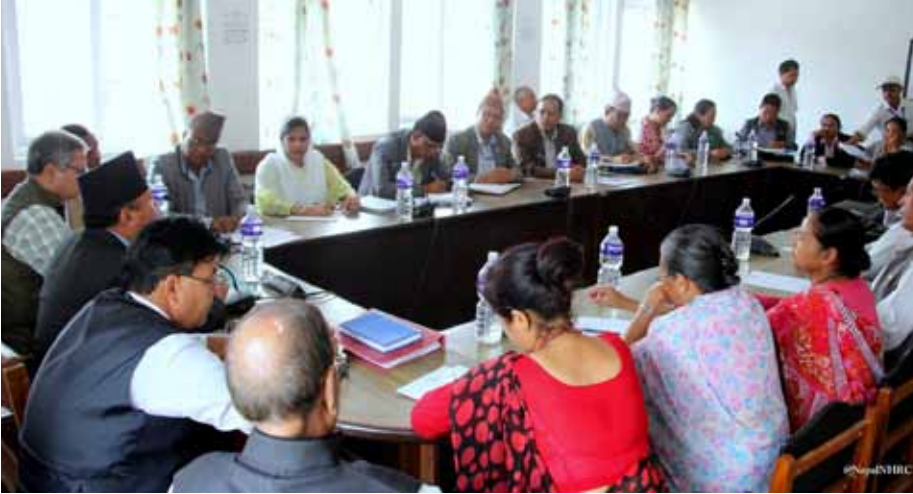
NHRC Officials with the representatives of the Social Justice and Human rights Committee at a meeting held on the post-quake recovery reconstruction efforts

LALITPUR: Social Justice and Human Rights Committee of Parliament and the National Human Rights Commission (NHRC) held discussion on jointly monitoring overall human rights situation in the country.