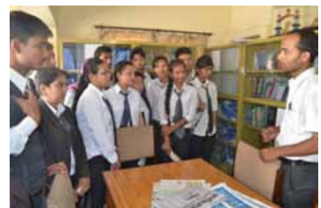
The NHRC staff explaining about the use of resource center with latest communication facility available

The students observed the complaint registration section and the resource center during their visit to the NHRC.