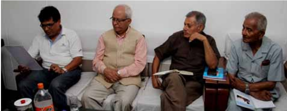
Former NHRC Chair Justice Kedar Nath Upadhyay accompanied by other former Commissioners at a meeting held on post-quake activities

LALITPUR: NHRC Central Office, NHRC had two different meetings with former NHRC Commissioners and Nepal Bar Association representatives respectively. The meetings discussed various pertinent human rights issues emerged due to the unprecedented earthquake that hit the nation in April and May, 2015. The discussion was also held on the post-quake recovery activities of the