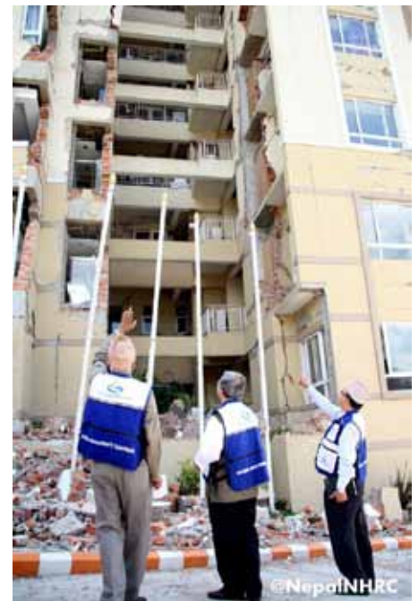
The NHRC high level monitoring team observing a highly damaged mansion in the valley during monitoring

On the occasion, CDO of Kathmandu, SSP of Metropolitan Police Office, Rani Pokhari of Kathmandu, Armed Police Force, NIB, Nepal Army representative and other security body officials were also present.