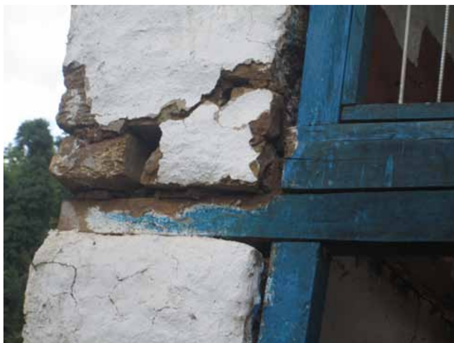
A house found still dwelled by the earthquake survivors in the earthquake hit district

Similarly, the relief amount was distributed to the families for performing the last rites of the victims killed in the earthquake while the injured were treated at government hospital free of cost. In the first phase of the relief distribution, Rs 5000/- was found provided to most victims as relief whose houses were damaged completely while the remaining amount was found distributed later. However, due to the lack of the accurate data on the victims and destroyed infrastructures, specially