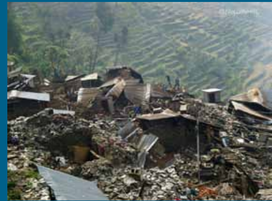
A scene of devastated village of Gorkha district

LALITPUR: A team of local residents and stakeholders of the earthquake ravaged Gorkha district have met with the NHRC officials and requested to take initiatives for relocating 13 earthquake affected Village Development Committees under serious risk at a safe place. They also urged to ensure the religious and cultural rights of the people while making an effort to shift the human settlement.