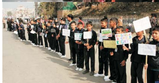
Human chain formed by school children demanding the initiative of the government to begin a talk in diplomatic level to end the humanitarian crisis that paves ways for the right to life and right to education