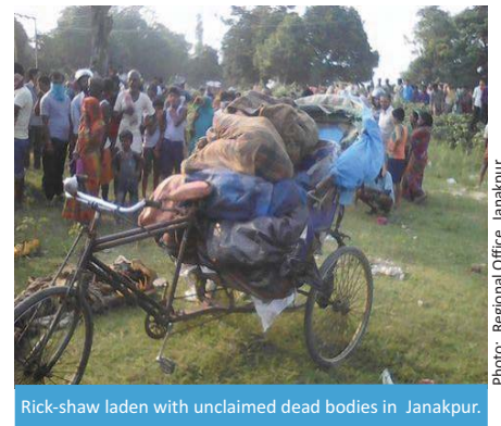
Rickshaw laden with unclaimed dead bodies in Janakpur.

The Commission has urged the political parties and the police administration to extend necessary support to help create conducive environment for the investigation process prior to the factual information being made public to evade the emergence of untoward situation.