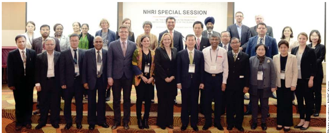
Participants at a ASEM Conference on Global Ageing and Human Rights of older Persons and NHRI Special Session held in Korea

Organized jointly by the National Human Rights Commission of Korea and Korean Ministry of Foreign Affairs, the conference was participated by 200 participants of 45 nations including the representatives of member states of ASEM, Human Rights Institutions, experts, academia and international non-governmental organizations among others.