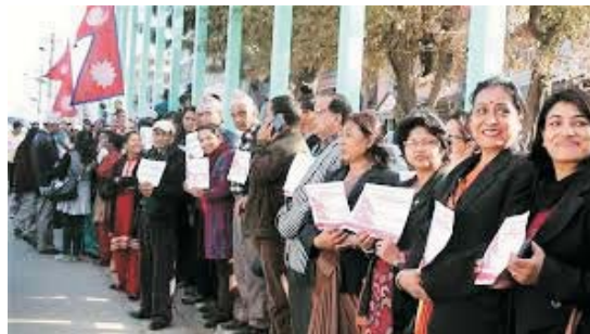
Human chain formed by the general citizens including human rights activists, youth organizations, writers and political party alliance as sign of protest against economic sanction imposed by India.

Citing the imposition of economic embargo as a malicious act against international laws, the participants of human chain urged the UN can't turn its deaf ear to burgeoning humanitarian crisis in Nepal. They also urged the government and Madhes-centric parties to hold meaningful talk and reach to the consensus at their earliest.