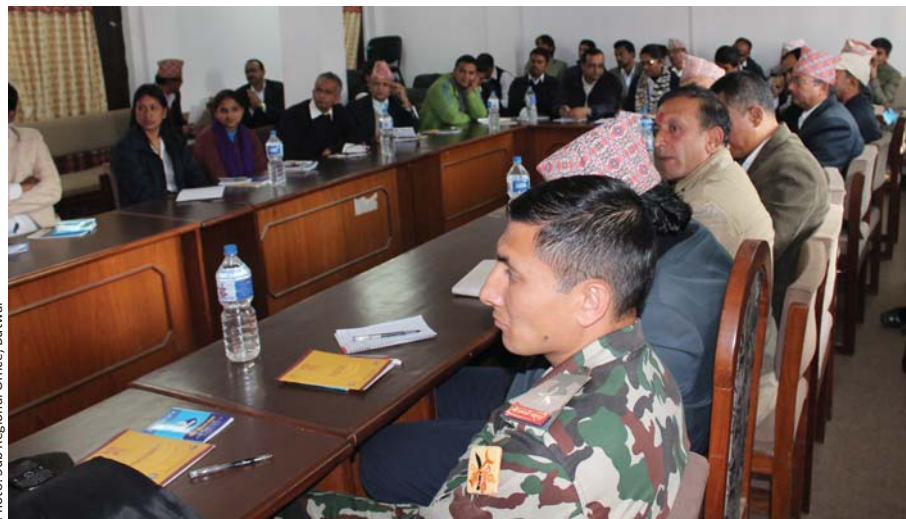
Participants representing the development actors at a program held on the mplmnttion status of the NHRAP in Palpa district

At the program, 50 participants comprising the Chief District Officer, District Education Officer, District Public Health Officer, Chiefs of the District Police Office, Nepal Army, District Child Welfare Officer, chiefs and representatives of the district based government offices, local level Peace Committee including Chief of Child and Women Development Officer were present.