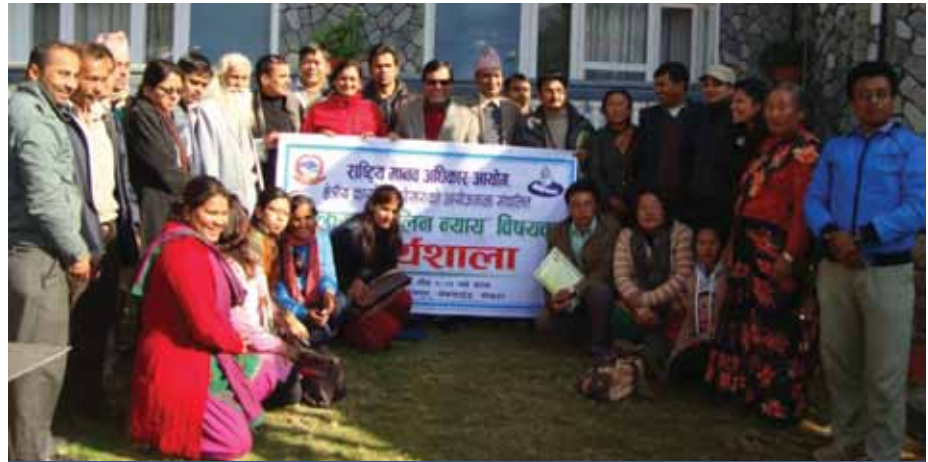
Trainers and participants pose for a group photo during a program on Transitional Justice organized in Pokhara, Kaski district

During the discussion session, the participants came up with various opinions and comments. They said the victims could get relief if the NHRC