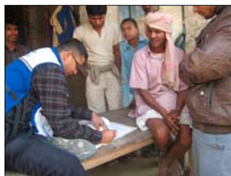
NHRC Missions comprising human rights officers conducting on-the-spot investigations on the complaints in different parts of the districts in south