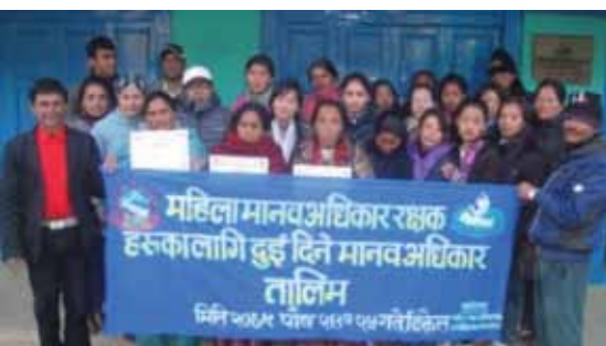
Trainers and woman human rights defenders at the training held on human rights in Khotang district

K HOTANG: The members of the women human rights network of Khotang district attended two day training on human rights on January 8 -9, 2013. The objective of the training was to enhance the capacity of women human rights defenders with the knowledge of basic human rights and the provisions set forth in the international human rights instruments.