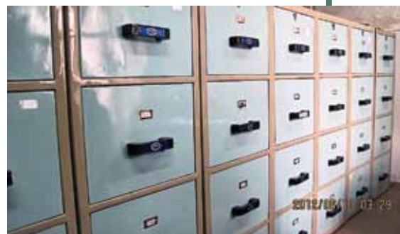
Fire proof cabinet installed at the NHRC archiving division

The data will be available at the NHRC website in the near future as per the NHRC