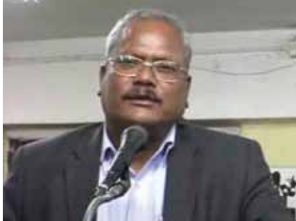
Deputy Prime Minister Bijay Kumar Gachchedar addressing a program held at NHRC on the occasion of 15 th Int'l Anti Torture Day