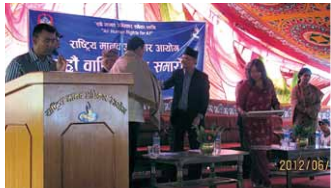
Human Rights Activist Chandra Kishore Jha being felicitated by Prime Minister Dr. Baburam Bhattarai at a function organized at NHRC on the occasion of the 12 th Anniversary of the NHRC