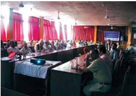
Participants at a program held at Pokhara on the occasion of the World Elder Abuse Awareness Day