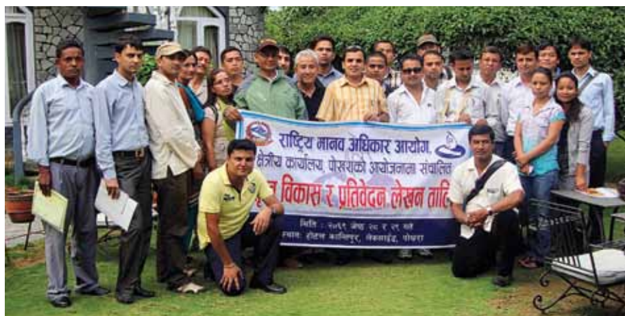
Participants and the resource persons taking a group photo after attending a training entitled proposal, report writing and leadership development held in Pokhara, Kaski district