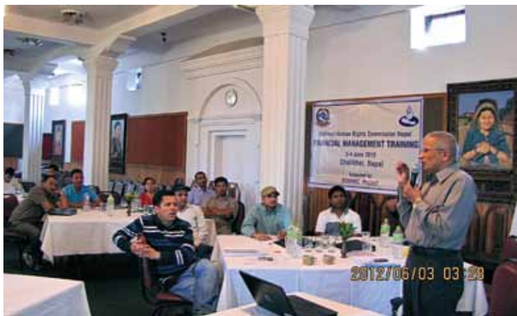
NHRC Senior officers and Admin/Finance Staff participating in a training held on Financial Management System

They also adjudged the methodology taught in the program as an instrument that would