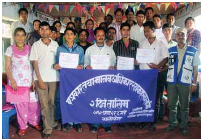
Trainees and the Resource Persons taking a paragraph after the training program on Human Rights organized in Kalikot in West