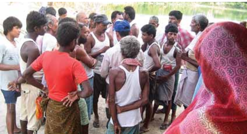
Victims of fire at Siraha placing their problem before the NHRC monitoring team.