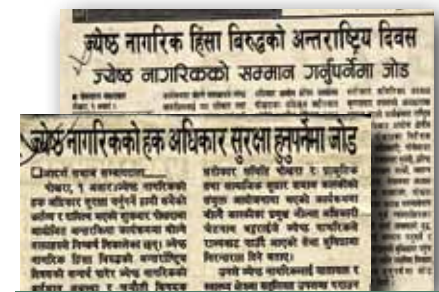
News in the vernacular dailies published on the occasion of the World Elder Abuse Awareness Day in Pokhara

Participants also stressed strongly on the implementation of the Senior Citizens Act -2063. In addition, it was also discussed that the senior citizens should be provided with the discount facility or exemption on travel fare.