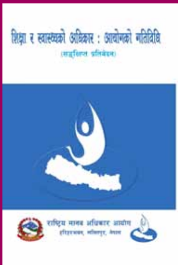
Report on Education & Health Rights-2014