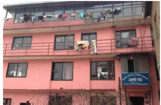
Aamaghar situated at Kalimati of Kathmandu district

Speaking at the same press conference, the executive director of Central Child Welfare Committee said that