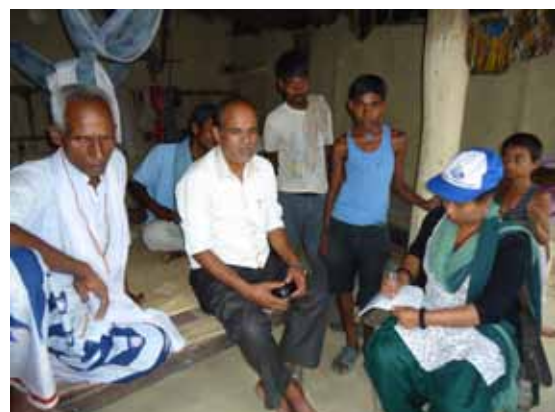
An investigation team member obtaining information about the rights violation from the victims' family members