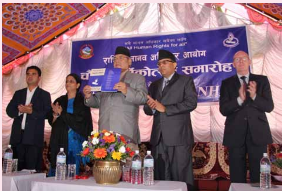
Officiating Prime Minister Bamdev Gautam releasing the NHRC publication on the occasion of the 14 th Anniversary of the NHRC, 2014