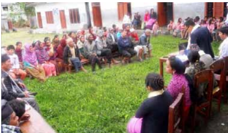
Participants at a program held on the racial discriminating in Kaski district