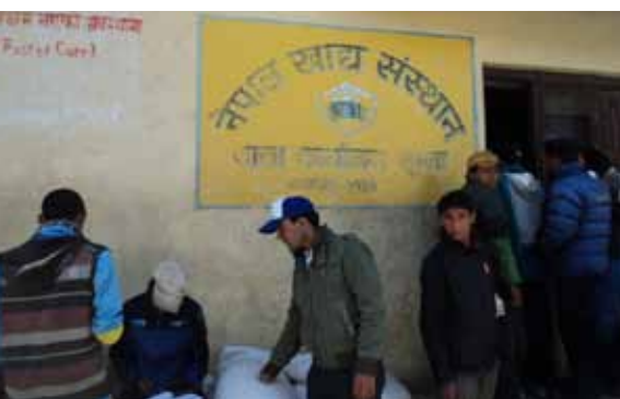
An NHRC Official monitoring the situation of the food crunch in Humla district