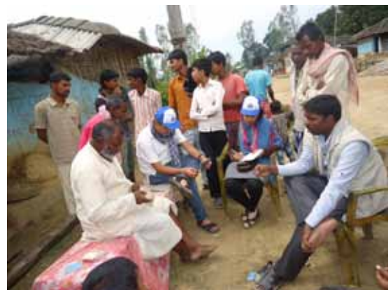
NHRC investigation team talking with the victims' family of the incidents of rights violations that occurred in the conflict period

Of the total 36 cases, 33 cases related to killing, sexual assault, abduction, disappearance and torture were investigated upon. Three cases being under the jurisdiction of Morang district still remain pending. The investigation was launched in coordination with the NHRC Regional and Sub-Regional Offices located in the respective region.