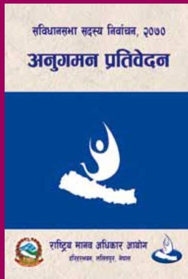
Report on CA Election Monitoring-2014