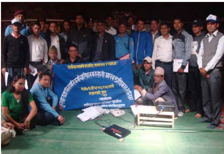
Resource persons and participants at human rights training organized among the representatives of the Dev. Actors in Mugu district

This program covered 7 important topics and 10 other sub-topics. Human Rights and its retention, the functions and duties of the Commission, laws related to national and international human rights, public responsibility, role of judiciary in the protection of human rights, role of non-governmental organization in the protection of human rights, national and international mechanisms related to human rights, role of coordination between governmental and non-governmental bodies including national human rights action place (NHRAP) were some of the issues that were discussed comprehensively. The program was divided into three parts where two issues were worked in teams.