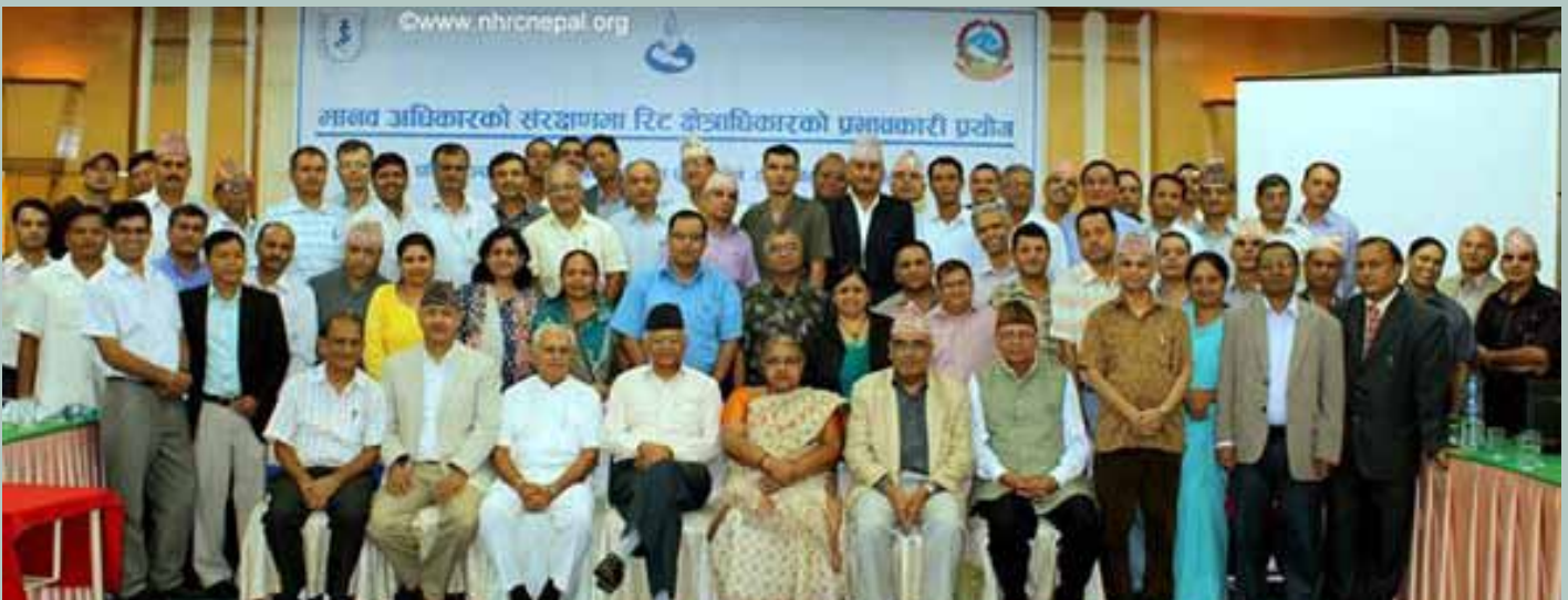
Sitting bigwigs from the appellate and district courts of various districts of Kaski, former NHRC Commissioner, NHRC Acting Secretary and other staff member at a program entitled the effective use of writ jurisdiction held in West