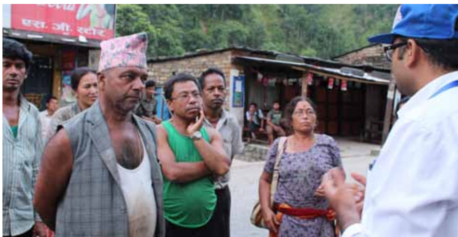
NHRC Official collecting information from the local residents and family members of landslide victims in Sindhupalchok district

The Commission has, therefore, urged to show high alertness lest there could be the prototype incidents following the sudden natural disaster