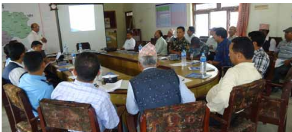
Resource person and the participants at an interaction program entitled NHRAP and UPR held in Palpa