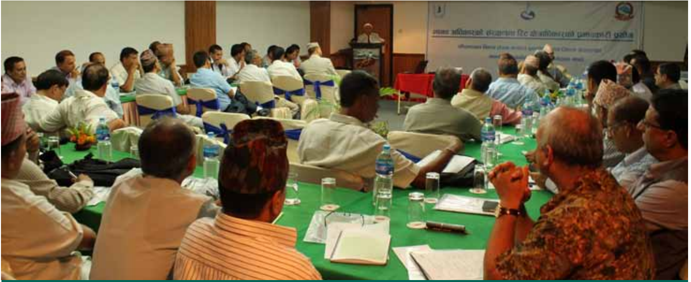
Former NHRC Commissioner Justice Ram Nagina Singh speaking at a program entitled the Effective Use of Writ Jurisdiction organized in Pokhara of Kaski district