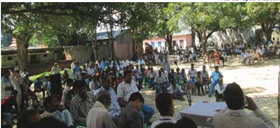
Local residents of Labani of Kapilvastu district attending a program entitled Public Hearing on Human Rights Situation and Accountability organized by the NHRC Sub Regional Office Butwal

The presentations at the program included the concepts of human rights, right to information, rights against torture and the rights of development. The presentations were followed by an open floor discussion in which the participants from Labani, Hathihawa, Nanada Nagar and Bithuwa Village Development Committees came up with issues such as; the grievances about inadequate service provided by