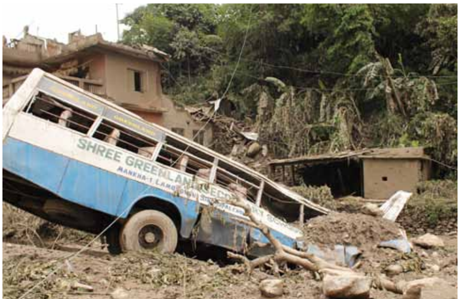
A school bus seen plunged headlong into the mud slide during the incident o of massive landslide in Sindhupalchowk district

in other districts as well. It has asked the concerned bodies to make necessary arrangement to mobilize the health teams in the would-be epidemics prone areas and also to make special arrangement for senior citizens, pregnant women, children, persons with physical disabilities and persons injured in the incidents.. Also recommended is the arrangement of psychosocial counselors for the displaced persons and children and also to the students.