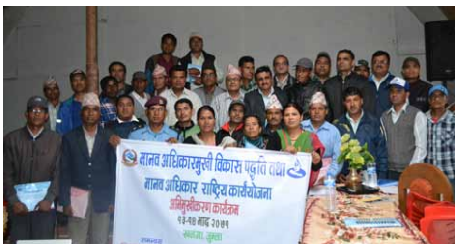
Participants and the resource person at a program held on HRBA to Development in Jumla district

Organized from August 29, 2013, the two day included a total of 45 participants representing various government offices; the District Administration Officer, Local Development Office, District Health Office, District Agriculture Office, Judiciary and Quasi Judiciary Offices under the purview of District Court.