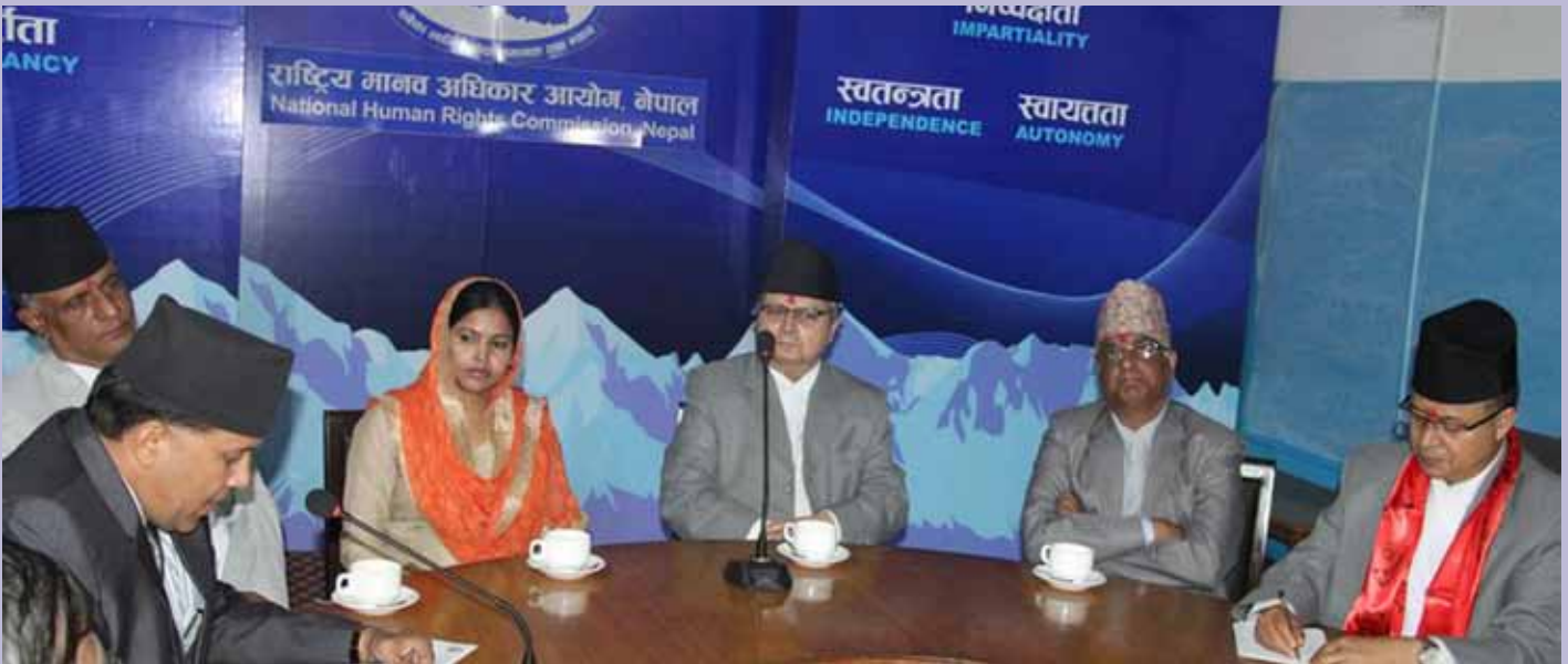
Newly appointed NHRC Chairperson and Commissioners attending the reception program upon assuming their office on the first day of their appointment at the Commission