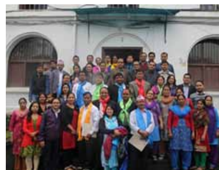
NHRC staff members posing for a group photo after giving farewell to the outgoing staff members