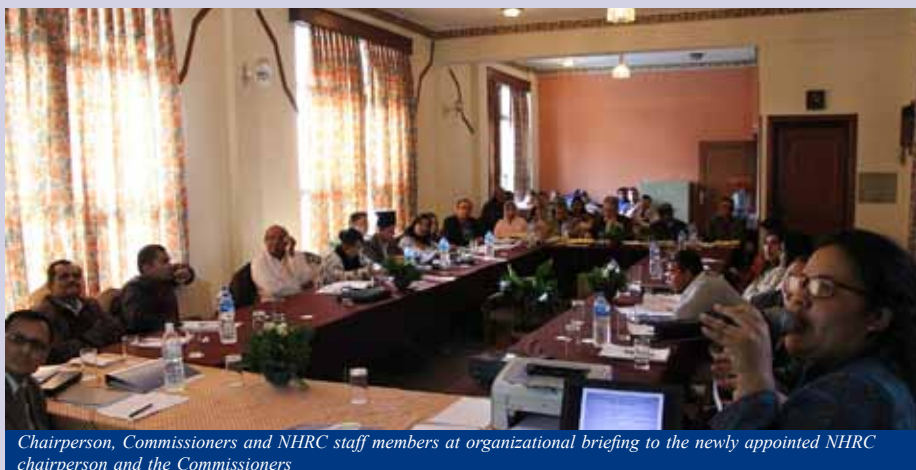
Chairperson, Commissioners and NHRC staff members at organizational briefing to the newly appointed NHRC chairperson and the Commissioners

Furthermore, larger discussions were held on the implementation status of the NHRC recommendations, future work plan, job permanency of the staff and their capacity development, the standard of the investigation upon the incidents of human rights violations including the coordination and collaboration with the stakeholder authorities.