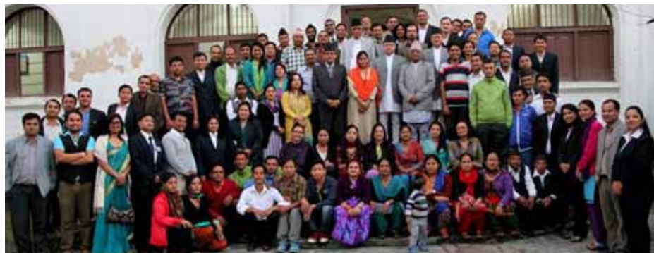
The NHRC staff members along with the newly appointed office bearers upon assuming their office at NHRC