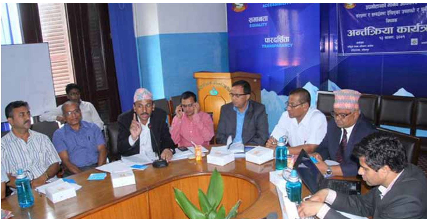
NHRC Officials along with the Chiefs and representatives of the government and non-government offices at a program held on consumer rights