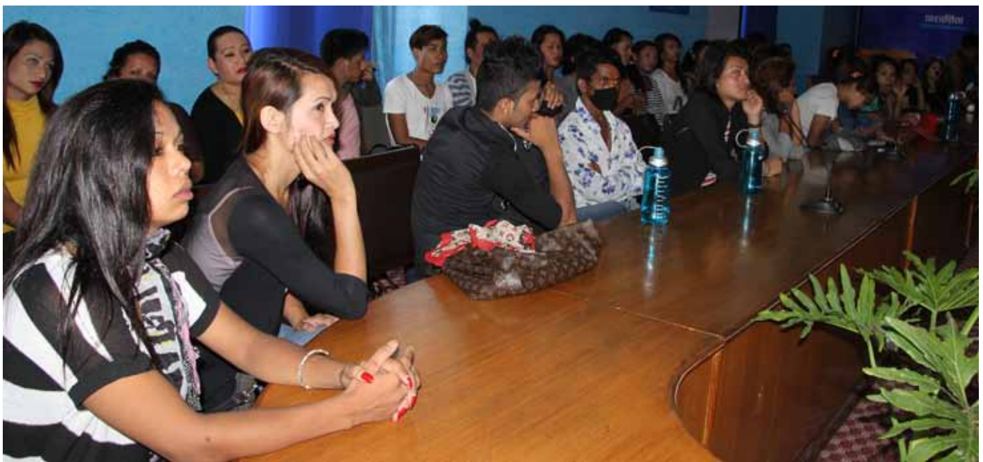
Representatives of Blue Diamond Society participating at a program organized at the NHRC