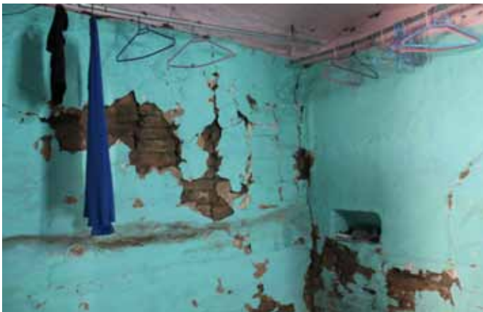
The damaged wall of the prison cell at the Central Jail, Kathmandu