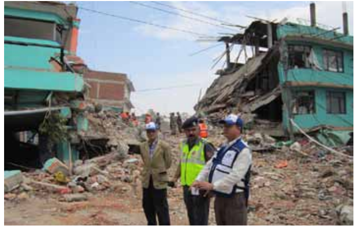
Monitoring on rescue work in devastated site in Kathmandu