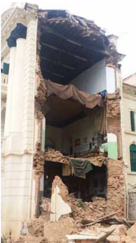
The damaged office building of Bal Mandir, Naxal (Kathmandu)

Following the directives of the commission, therefore, a team of Nepal Police evacuated the building and rehabilitated the disaster-hit children aged ranging from 3 to 15 at the building specified by the District Administration and the Education Ministry at the presence of the Commission.