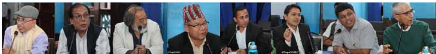
Former NHRC Commissioners and other participants sharing their inputs and suggestions at a program held on the implementation status of the NHRC recommendations

The Commission may make public names of officials, persons or agencies that do not knowingly implement or observe the recommendations or orders or directives made by the Commission with regard to violation