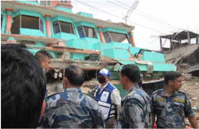
Monitoring on rescue work in devastated site in Kathmandu