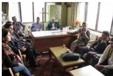
The NHRC team holding a talk with the concerned prior to rehabilitating the children of Bal Mandir

Massive Earthquake damages Office Building of the Commission, may fall apart any time