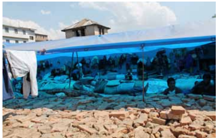
Inmates taking shelter at the premises of collapsed building outside the Central Jail, Kathmandu