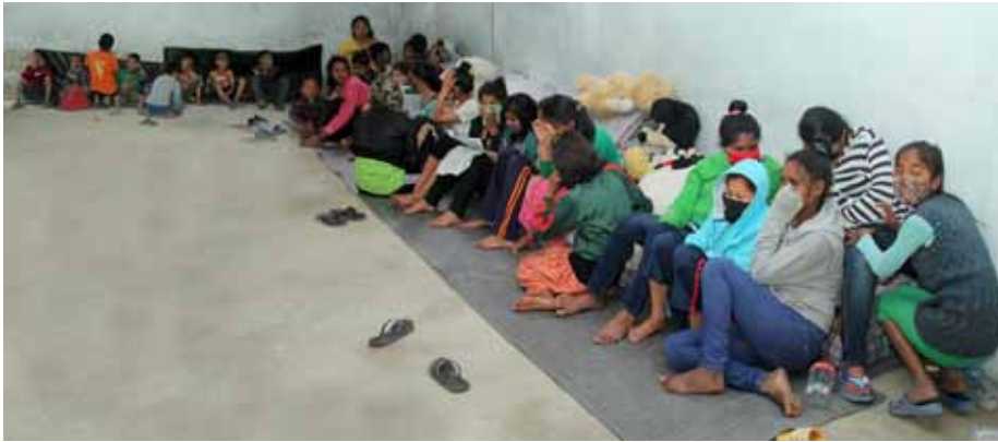
Children after the building of Bal Mandir was damaged

KATHMANDU: The massive earthquake didn't spare the building of Bal Mandir (Children Home) at Naxal, Kathmandu. Two hundred children were rendered shelter less following the heavy damage caused to the building by the earthquake on 25 th April, 2015. Following the damage, the Bal Mandir management was compelled to keep the children at a garage situated at the