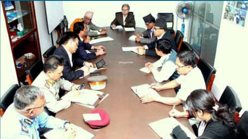
Chairperson Justice Anup Raj Sharma, Commissioners and the Officials from the OPM, Ministry of Home Affairs and the Chiefs of Security Agencies at a discussion held on the Gaur incident

LALITPUR: The National Human Rights Commission has conducted monitoring on the protest program organized in Gaur following the expansion of the service centers under the purview of the government offices in Rautahat district.