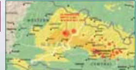
Nepal Earthquake-2015 Epicenter-Barpak, Gorkha, 7.8 Magnitude, North-west of Kathmandu