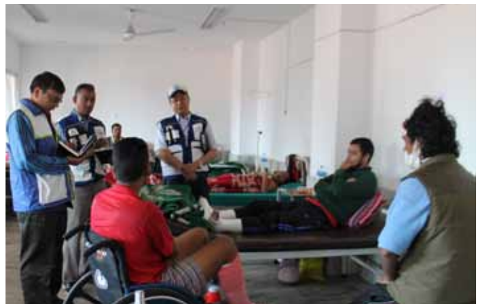
Monitoring on Jail hospital at the Central Jail, Kathmandu