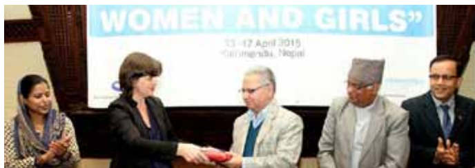
APF and NHRC-Nepal officials exchanging token of love after the workshop