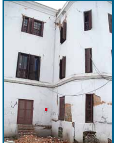
The NHRC Office Building damaged by the massive earthquake of 25th April-2015

Massive Earthquake damages Office Building of the Commission, may fall apart any time