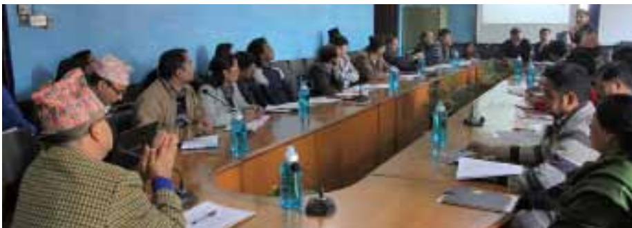
Commissioner Sudip Pathak responding to the queries raised by the representatives of the security agencies at a program held on UPR process in Lalitpur

LALITPUR: While the NHRC in full swing in preparing the Universal Periodic Review (UPR) Report to be submitted to the Human Rights Council, Geneva, a consultation was held with the Government agencies including Nepal Police, Armed Police on the draft UPR report on 1st March 2015.