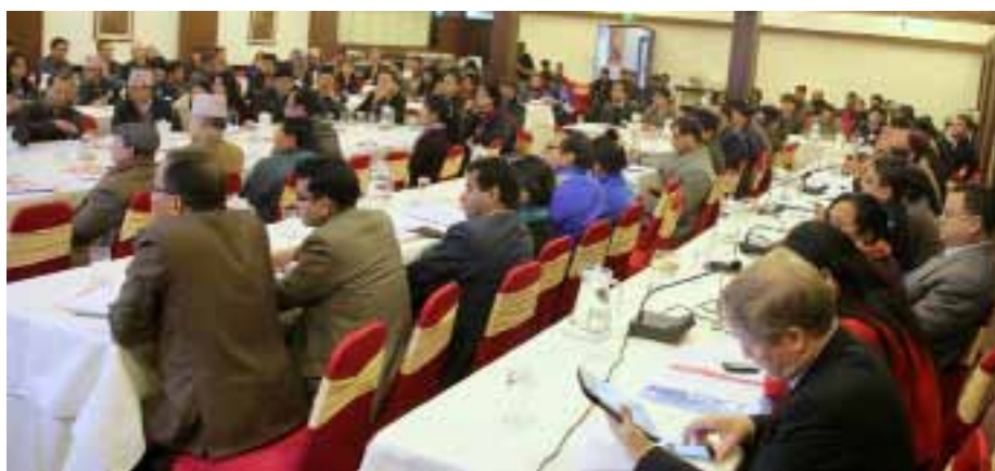
Participants at the national level consultation on UPR process held in Kathmandu

'I, as the representative of the government, am committed to human rights and will give directives