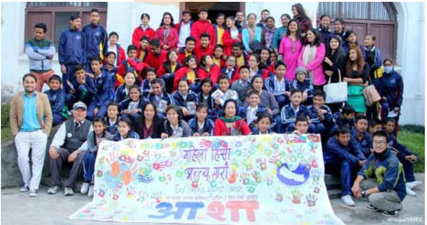
Participating students, teachers from various schools in the valley along with the NHRC staff members during the solidarity program on the occasion of the International Women's Day held at NHRC

HRFFN invited the NHRC to collaborate in these holistic efforts, first with a program directed towards students on March 8 th , International Women's Day. The program entered