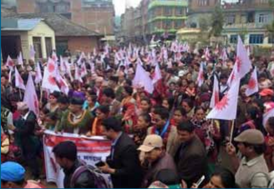
Rally organized by the political parties before By-election of the Constituent Assembly Election being held in Baglung district.

B AGLUNG: The NHRC Regional Office, Pokhara has monitored the filing of the candidature nomination for the Constituent Assembly by-election to be held in constituency No. 1 in Baglung district.