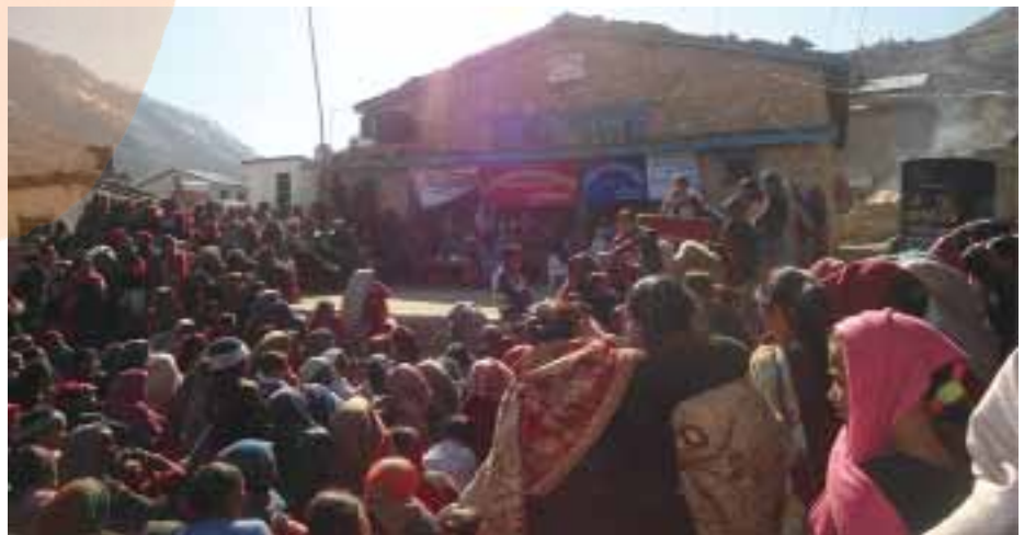
A human rights rally organized held in Jumla on the occasion of the International Women's Day

Meanwhile, a human rights rally was organized as one of the major events on the occasion. More than 400 participants representing the government offices security agencies,