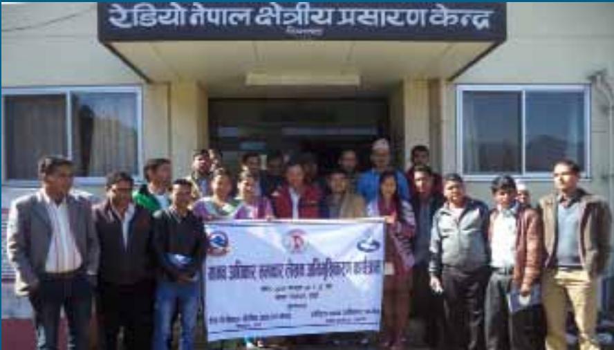
The resource person and participating trainees from the radio stations under the purview of the Radio Nepal at a human rights training in Dhangadhi

D HANGADHI: Human Rights training was organized with main focus on news reporting with human rights perspective by NHRC Regional Office, Dhangadhi on 12th and 13th March at District headquarter of Doti and Dipayal.