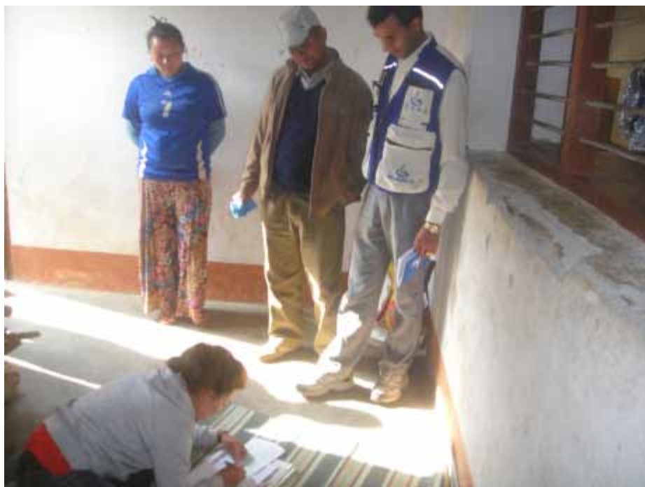
The female inmate giving her exam sitting on the floor due to the lack of sitting arrangement in the prison found during the monitoring on the SLC examinations conducted in the district prison by NHRC Sub Regional Office, Jumla

Inmates in Khotang Prison appear in SLC Examinations, Monitoring conducted from Human Rights Perspective.