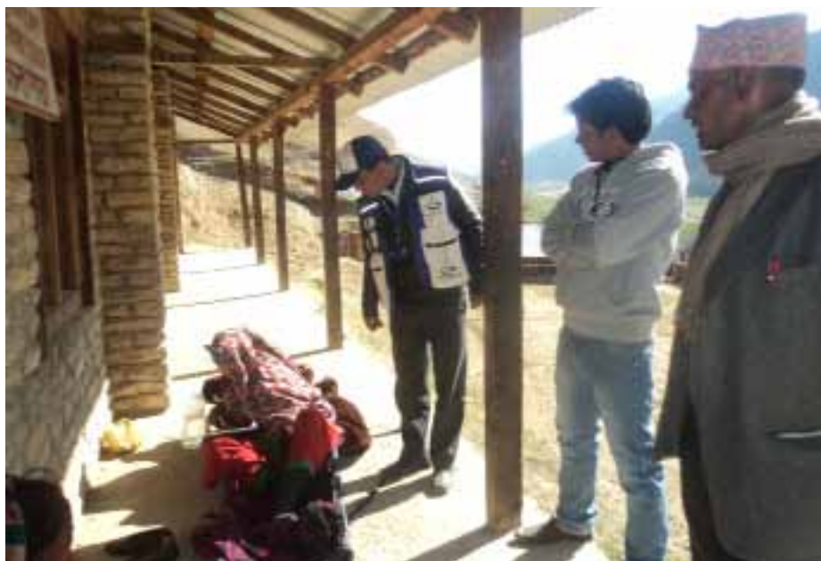
NHRC Officer monitoring on the SLE examinees giving her examines sitting on the stretcher in Jumla district.

inside the examination hall was peaceful, some schools endured the external disturbances. At some centers, the invigilators were more than the required numbers. Even the non-teaching persons were found deputed as invigilators. The center-in-charge was not found delegated with adequate power vested on him. The centers also lack the monitoring by the concerned authorities, the report sent from SRO, Jumla mentions.