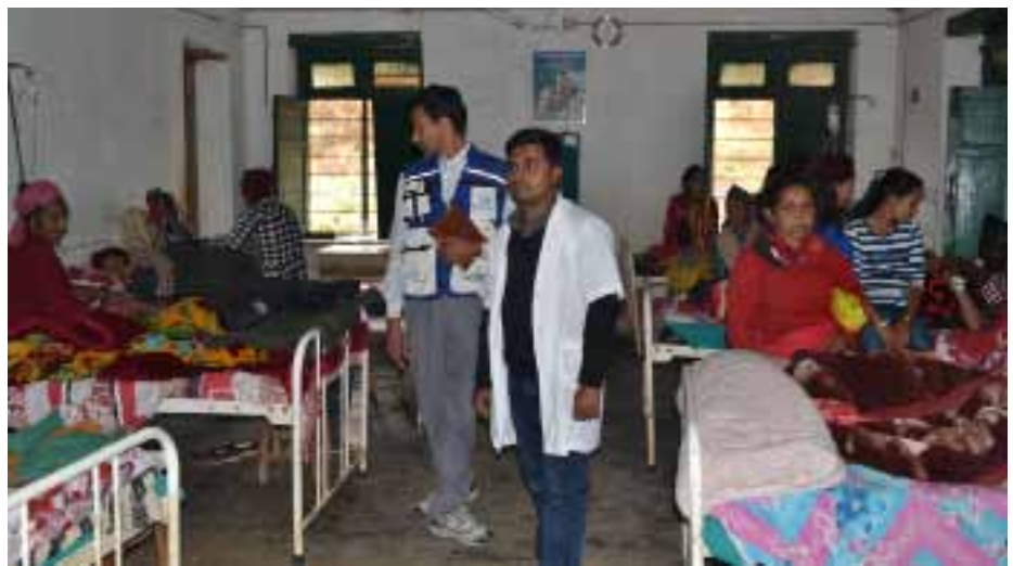
The Staff Members from the NHRC Sub Regional Office Khotang during the inspection at the district hospital, Khotang