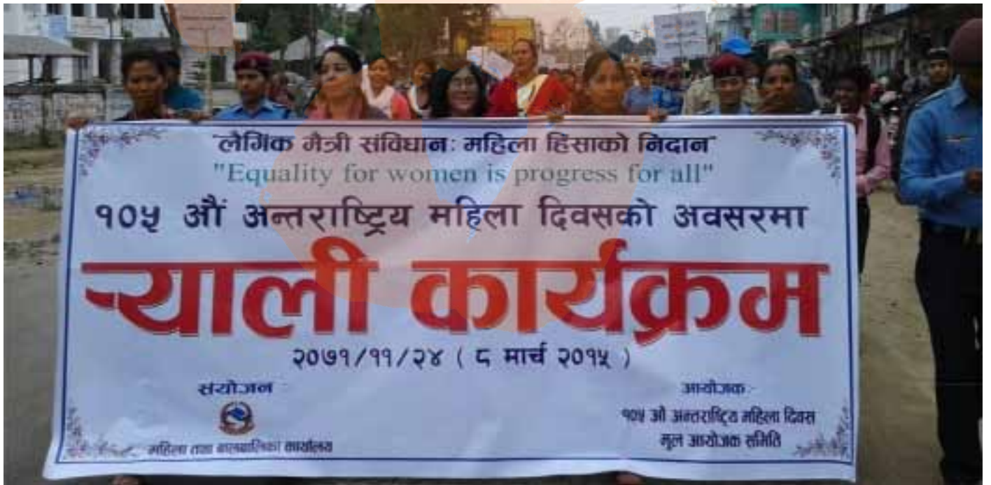
A human rights rally organized by various NGOs and government agencies in coordination with the NHRC Regional Office Dhangadhi on the occasion of the 105th International Women's Day in Dhangadhi

DHANGADHI: 105 th International Women's day has been celebrated in Dhangadhi with the slogan of 'Gender Friendly Constitution, end of Violence against Women.' NHRC, Women and Children Office, Women's Rehabilitation Center (WOREC Nepal), Nepal Police, Women cell, INGOs, NGOs, government offices, journalists, victims, students and other organizations working for