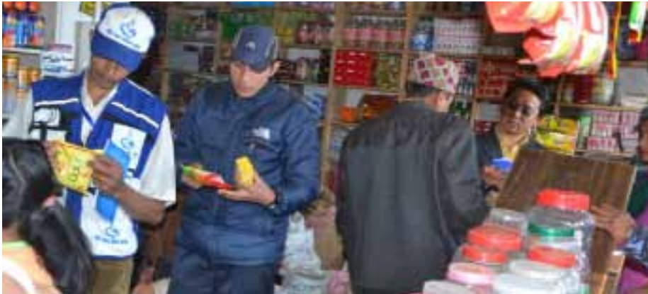
NHRC Officers of the NHRC Sub Regional Office Khotang and the Officials from of the District Administration Office during the market monitoring in Diktel Bazaar, Khotang district.