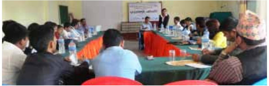
Resource persons and the participants at a program on the effective implementation of the international commitments held in Kapilvastu

KAPILVASTU/RUPANDEHI: An interaction-cum-consultation program organized by NHRC Sub-Regional Office, Butwal on the Convention on the Rights of Child (CRC) in Kapilvastu district on March 2, 2015.