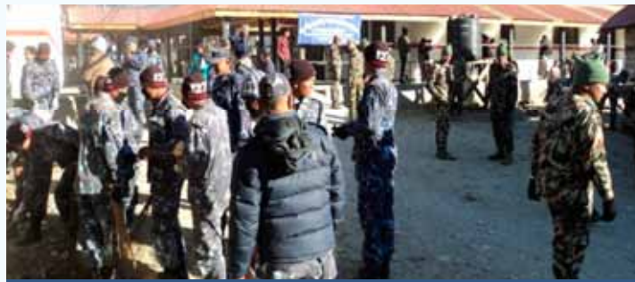
Security Personnel participating in Sanitation Campaign held in Jumla to mark the 64th Int'l Human Rights Day - 2012.

Around fifteen hundred people representing the cross-section of the society participated in the campaign.