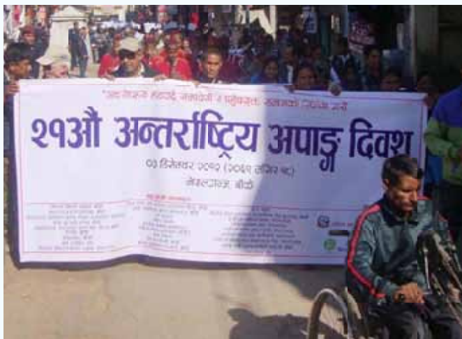
Participants at a rally organized to mark the 21 st International Disabled Day in Nepalgunj

B ANKE: On the occasion of the '21st International Disabled Day,' an interaction program entitling the Effective Implementation of Legal Provisions: Ensure the Rights of Persons with Disabilities was held in Nepalgunj on December 3, 2012. The program carrying the slogan 'Remove Obstacles and Build a Inclusive and Accessible Society' was jointly organized by the NHRC Regional Office, INSEC, National Federation for the Persons with Disabilities, Human Rights Network and Women and Children Office - Nepalgunj.