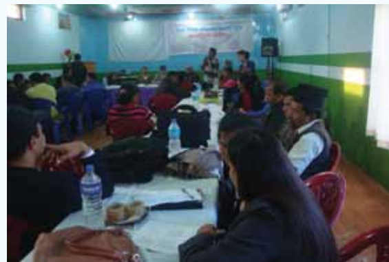
Participants at an interaction program held in Nepalgunj on the violence against women and access to justice