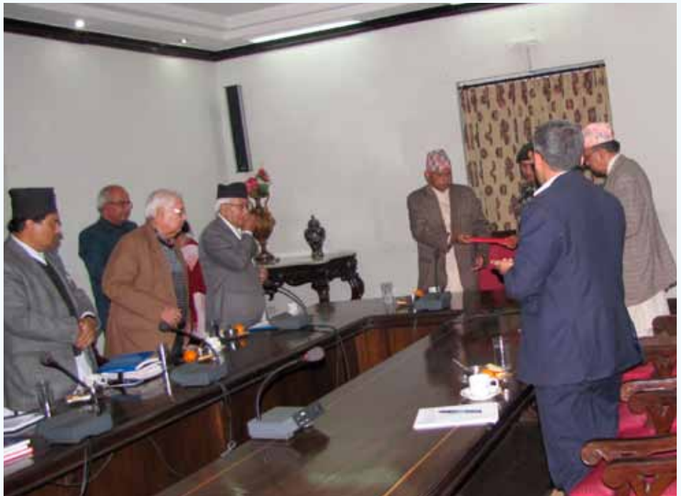
President Dr. Ram Baran Yadav along with the NHRC Officials during the submission of the NHRC Annual Report amidst a program held at Rastrapati Bhawan on 7th December, 2012

The compensations are provided to the victims but the government