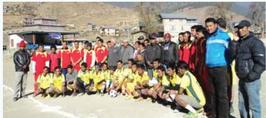
Chief Guest, Match Officials and the players representing the "Human Rights - Eleven" and "Administration - Eleven" at a friendly football match organized in Jumla on the occasion of the Int'l Human Rights Day - 2012.

At the end of the tournament the awards and certificates were given away by the Chief Guest to the technical team conducting the tournament, Sports Development Committee, District Football Association (ANFA) and the participants of the tournament.