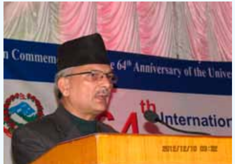
Prime Minister Dr. Babu Ram Bhattarai addressing a program organized by the NHRC on the occasion of the 64th Int'l Human Rights Day

L ALITPUR: Prime Minister Dr. Baburam Bhattarai has said that the new constitution will ensure the rights of the citizens in a progressive manner as their guarantee was essential to the existence of the democracy.