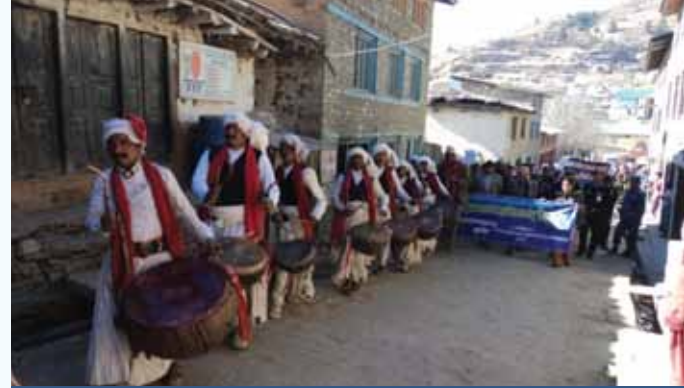
Participants at a rally organized in Jumla on the occasion of the Int'l Human rights Day -2012

The local media, especially radios of Jumla, had aired special talk programs