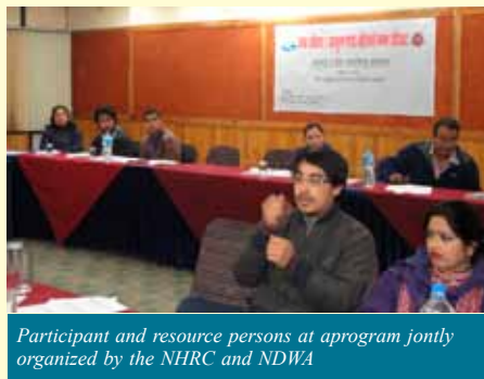
Participant and resource persons at a program jointly organized by the NHRC and NDWA

Discussion taps Impetus on the Rights of Disabled Women