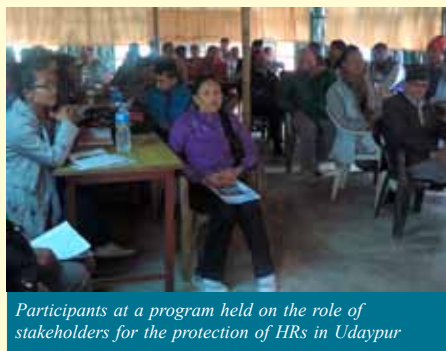
Participants at a program held on the role of stakeholders for the protection of HRs in Udaypur

Rights Situation in the Path of Improvement in East