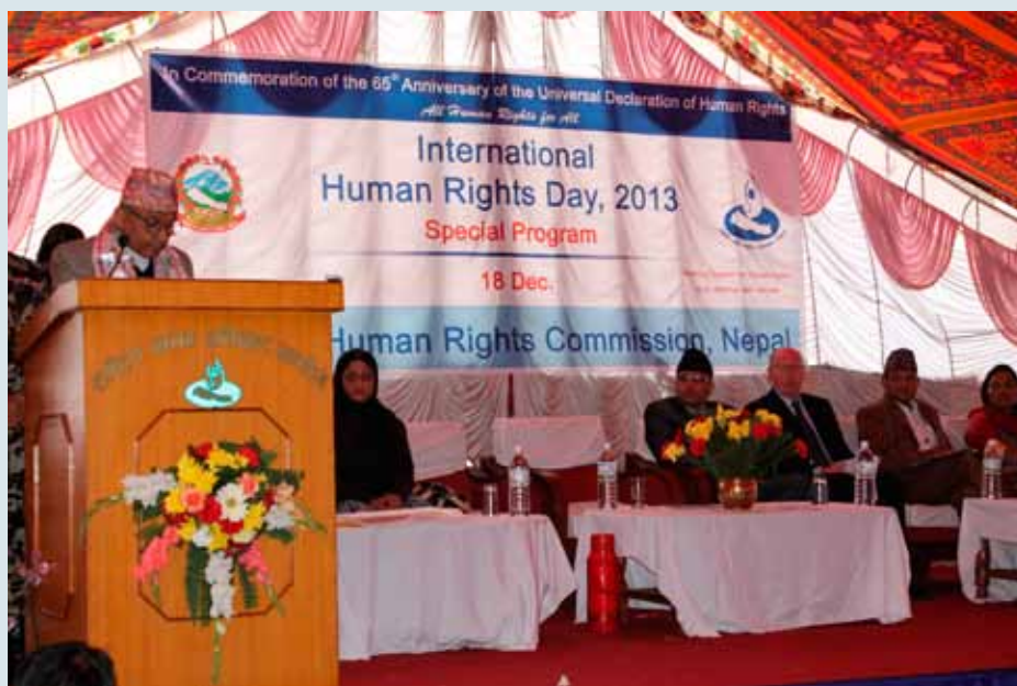
Rt. Hon. Chair of the Council of Ministers Khila Raj Regmi addressing at the special program organized at the NHRC on the occasion of the 65th International Human Rights Day, 2013

LALITPUR: The Chair of Council of Ministers Khila Raj Regmi said, ‘The government is committed to the preservation, protection and promotion of human rights in the country.’