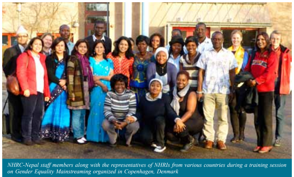
NHRC-Nepal staff members along with the representatives of NHRIs from various countries during a training session on Gender Equality Mainstreaming organized in Copenhagen, Denmark

The participants gained knowledge on the core concepts, strategies and tools in relation to gender equality applied by Danish and international actors in development cooperation and also by their home country governments. This course addresses these development trends and the need for a renewed common understanding of emerging opportunities and constraints including the methodology to address these in the coming years.