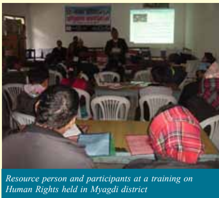
Resource person and participants at a training on Human Rights held in Myagdi district

The objective of the training was to enhance collaboration between the NHRC and the human rights workers in the district, to bring about awareness on human rights and human rights education, to enhance the capacity of the human rights defenders and to help reach human rights activities to the grass roots level people in the village.