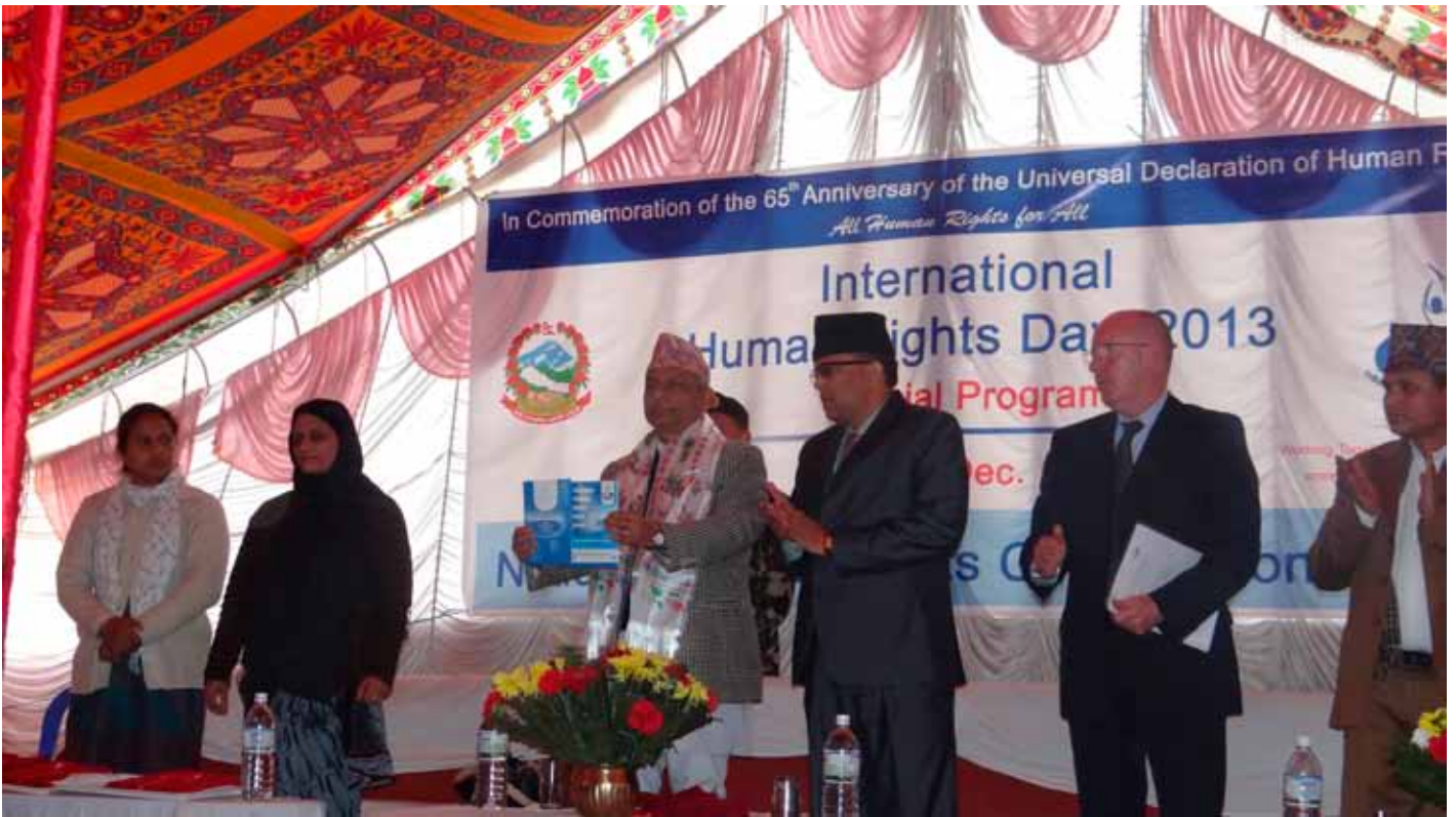
Rt. Hon. Khila Raj Regmi, Chair of Council of Ministers releasing the NHRC publications at a special program organized to mark the 65th International Human Rights Day, 2013