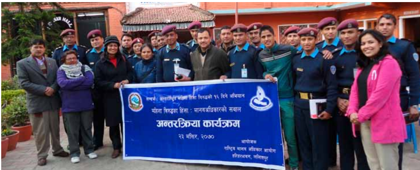
Representatives of security agencies along with the resource persons from the NHRC at an interaction program held on the violence against women

BHAKTAPUR : Coinciding with the 16 day campaign held on Violence against Women (VAW), the Office of the National Human Rights Commission organized an interaction entitling 'violence against women, the issue of women human rights in relevant to white ribbon & 16 days campaign on violence against women'.