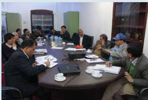
Former NHRC Officials during the meeting held on monitoring update, high level monitoring formation held at the NHRC.