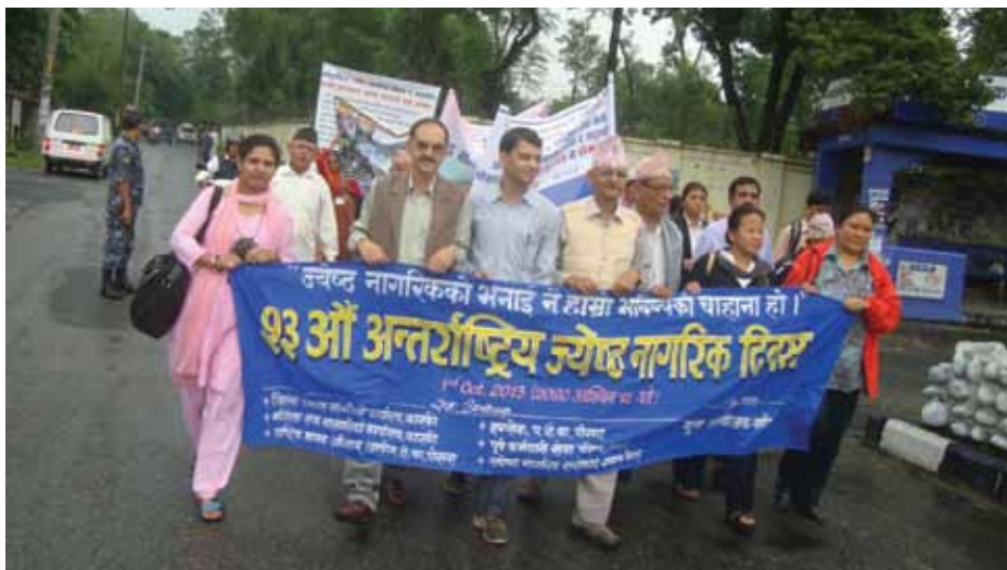
Participants and the human rights front runners at a morning rally held in lake city Pokhara on the occasion of the Int'l Senior Citizens Day

KASKI: The participants at a program held in Pokhara have stressed for the respect, protection and promotion of the rights of senior citizens.