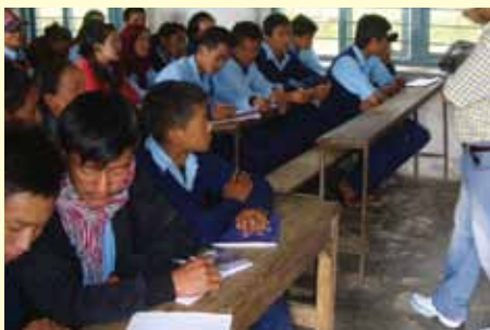
Resource person facilitating the human rights education program organized in Lamjung district.

Stakeholders familiarized with human rights education on West