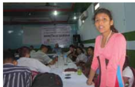
A girl Child speaking on the occasion of the International Children's Day at an interaction program held in Banke district