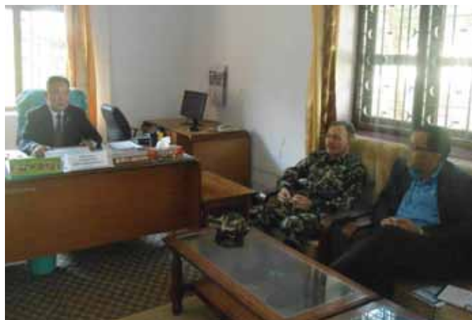
NHRC Acting Secretary along with the Regional Administrative Chief and the Brigadier of Nepal Army at a meeting held in Dipayal on the security arrangement during the CA election

solutions to the problems through dialogues and consensus.