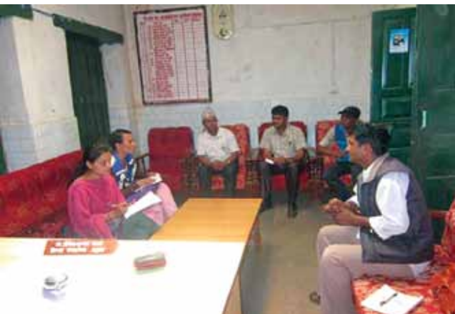
Monitoring team and the representatives of the Government agencies at a meeting held on ECC rights in Banke district

BANKE : The NHRC Regional Office Nepalgunj deployed the monitoring team in the mountain district Jajarkot on March 23, 2013 to collect the factual information with regard to Economic, Social and Cultural (ESC) rights.