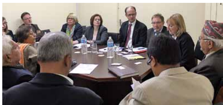
Representatives of German Delegation along the NHRC Office Bearers at a meeting held on bilateral relation held at NHRC

On being asked how NHRC is going to materialize its stance in the issues raised pertaining to the flaws in the ordinance, the Chairperson said that recently issued TRC ordinance came under severe scrutiny from both international and national rights organizations including the civil society. NHRC, on the other hand, is clear in its stance that the Ordinance being the victim unfriendly, it will not serve the purpose if brought without revamping certain provisions that contradicts with the international standards and norms.