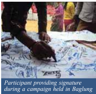
Participant providing signature during a campaign held in Baglung

B AGLUNG: Satkarma Nepal and Conflict Affected Victim Society in collaboration with NHRC organized the advocacy program coinciding the auspicious Chaitra Asthami Fete – 2013.