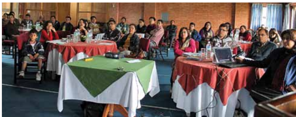
Participants at a program held on Gender Equality and Social Inclusion organized by NHRC

With the technical support provided from SCNHR Project/UNDP, the program was organized by Gender Equality and Social Inclusion Division, established of late under the purview of NHRC.