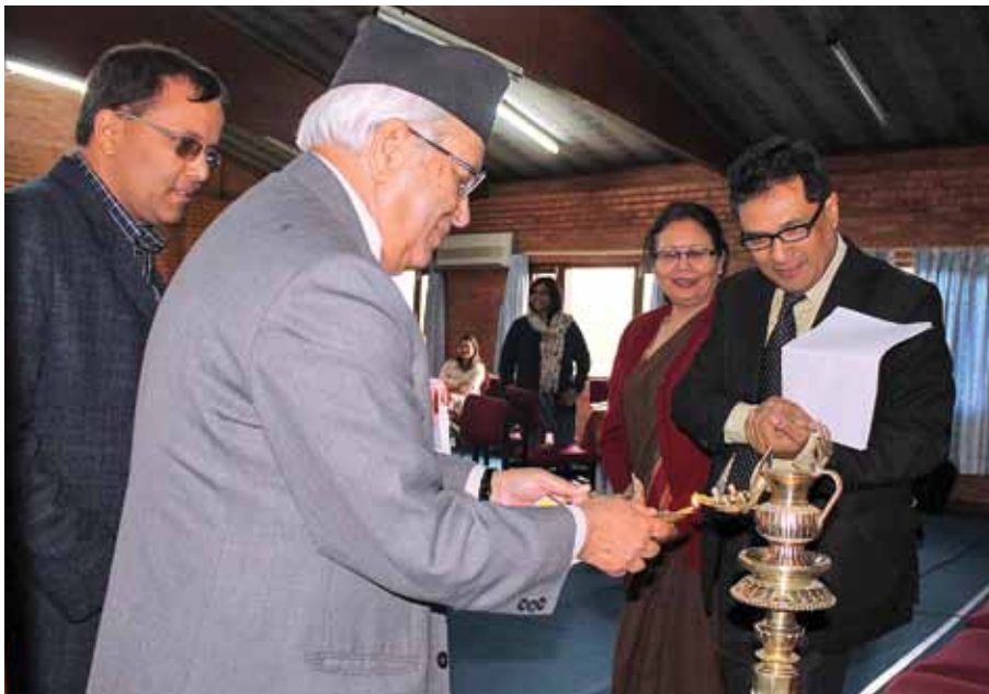
Chairperson inaugurating the program entitled Gender Equality and Social Inclusion held in Lalitpur