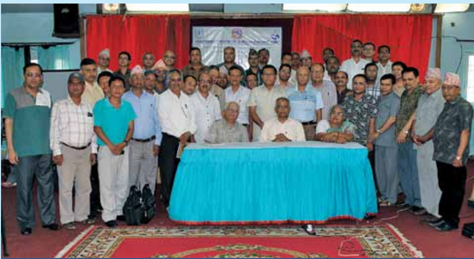
Resource persons and the participants at the workshop on the use of Writ Jurisdiction held in Biratnagar