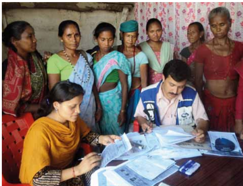
The members of the conflict affected families look on while the NHRC officials are verifying the documents related to the conflict victims in Bardiya district

During this program, 150 participants comprising the government officials, human rights activists, media persons including the conflict victims of 11 village development committees of Rajapur area were present.