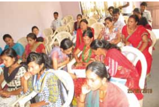
Woman participants at a program entitled the integration of human rights education in informal education organized Sindhupalchok district

The participants also insisted on to exert concerted effort for reviewing the syllabus related to the informal education and recommend whether or not the same is human rights friendly. Also, the participants emphasized on strengthening the capacity of the stakeholders including the human resources involved in the informal education sector.