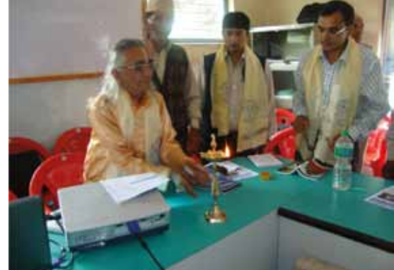
Inauguration of the interaction program on the rights of senior citizens held in Pokhara

During the program, the participants discussed widely on