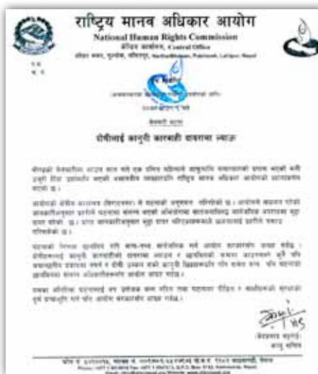
NHRC Press Release issued on the incident

The Commission has, therefore, urged the Government to find out the truth and launch a fair probe into the incident. The Commission has also urged the officials involved in the investigation to help book