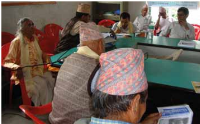
Participants of the Interaction Program entitled the 'Role of stakeholders in the Protection of the Rights of Senior Citizens' organised by the NHRC Regional Office Pokhara in Kaski district

The participants of the program comprised the chiefs and representatives of the NGOs, social workers, intellectuals, chair and life members of the Senior Citizens Concern Society -Nepal and media among others.