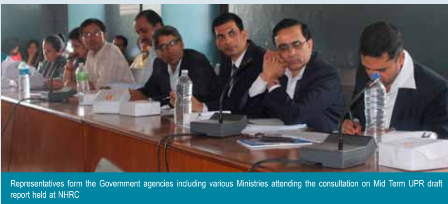
Representatives from the Government agencies including various Ministries attending the consultation on Mid Term UPR draft report held at NHRC