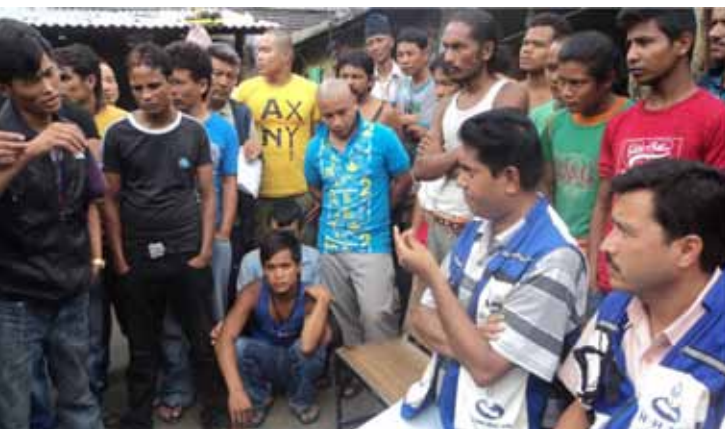
NHRC Officials from the NHRC Regional Office, Nepalgunj interacting with inmates in district prison of Rolpa during the monitoring