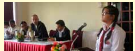
A girl child speaking on the occasion of the report release on the implementation status of the UPR recommendations

65 participants comprising the principal, teachers and students took part in the orientation program.