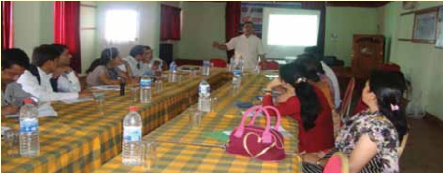
Resource person and the participants at training held on Fair Trial and Human Rights in Kaski

KASKI: The NHRC Regional Office Pokhara organized two day training on human rights and fair trial in Pokhara on July 14-15, 2013.