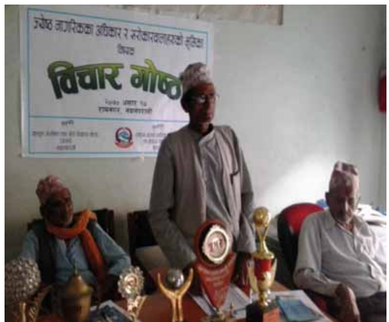
Senior citizens participating at the seminar organized for the rights of the senior citizens in Nawalparasi