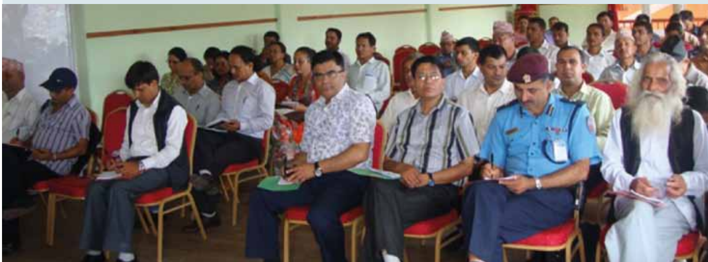
Participants representing various government agencies, civil society, media and legal professionals including the senior human rights activists among others at a program organized on the CA Election and Human Rights in Pokhara

The Constituent Assembly comprised of a unicameral body of 601 members constituted as a result of the first ever CA election held in Nepal on April 10, 2008. Following its unprecedented dissolution on May 27, 2012 without brewing any result concerning the framing of the new constitution, the government has yet again decided to hold election amidst ongoing political rift.