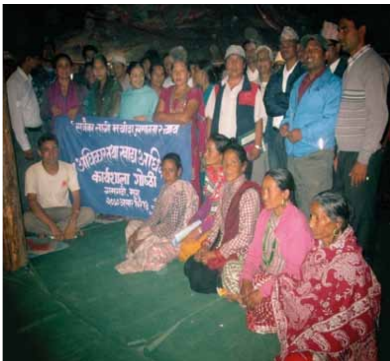
Participants at a program held on the right to food in Khalanga of Mugu district

Fifty seven participant comprising the representatives from media, teachers, government offices, judicial and quasi judiciary authorities, civil society academia including the representatives of human rights organizations participated in the workshop.