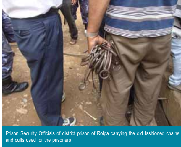
Prison Security Officials of district prison of Rolpa carrying the old fashioned chains and cuffs used for the prisoners