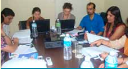
NHRC Officials along with the experts from Danish Institute of Human Rights (DIHR) during a workshop held on human rights education

LALITPUR: The National Human Rights Commission organized a workshop in collaboration with the Danish Institute of Human Rights (DIHR) in Lalitpur. The objective of the two day workshop was to design and develop complete manual to impart human rights education to the citizens of all walks of life.