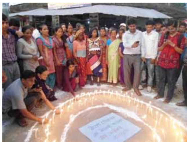
Participants lighting the candles in commemoration of the disappeared people during the decade long armed conflict in Pokhara

Enforced disappearance is used as a strategy to spread terror within the society. It occurs when people are arrested, detained or abducted against their will and when governments refuse to disclose the whereabouts of these people. Enforced disappearance is a global problem and is not restricted to a specific region of the world.