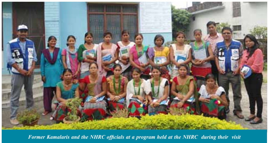
Former Kamalaris and the NHRC officials at a program held at the NHRC during their visit

On behalf of the Commission, the Kamalaris were provided with a session on the