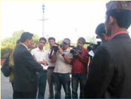
NHRC Member/Spokesperson responding to the queries of journalists upon the submission of the NHRC annual report to President

The government has implemented only 99 out of 501 recommendations made by the Commission. Urging the political parties to respect the rule of law, the Commission has also suggested to the Government to implement the NHRC recommendations without any dilly dallying.