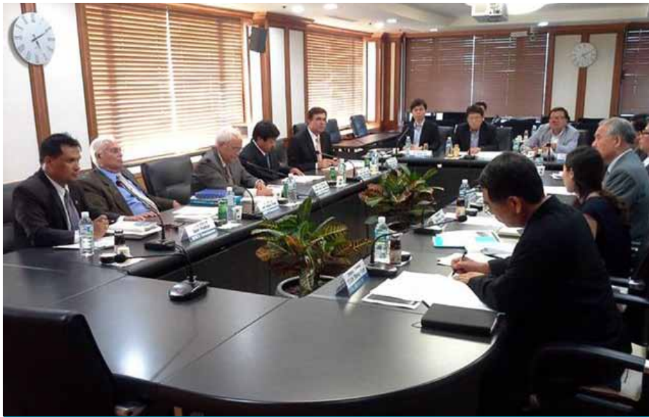
Officials from NHRC-Nepal having discussion with the NHRC – Korea Officials at a program organized during the observation and monitoring visit of the NRC – Nepal to Korea

The NHRC Commissioners concluded the observation and monitoring on the rights of migrant workers during their recent visit to South Korea and Malaysia.