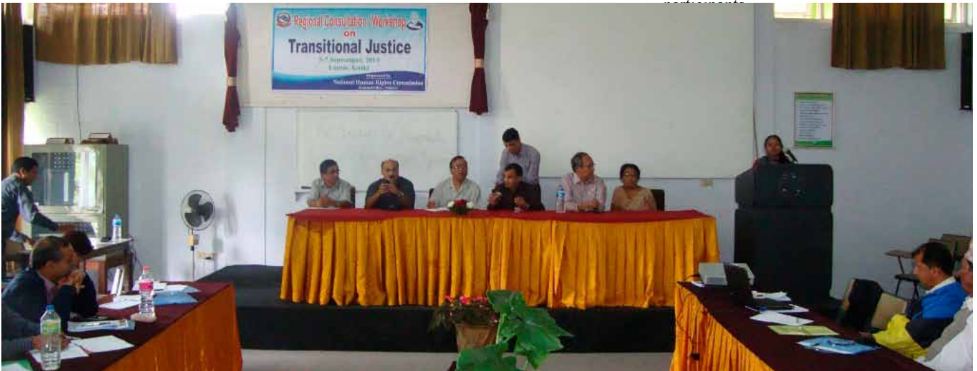
Human Rights activists, Human Rights experts and participants at a workshop program held on Transitional Justice Mechanisms in Pokhara

With overall commitments for the protection of human rights in the country, therefore, the workshop also issued the Lumle Declaration on Transitional Justice in the presence of 75 participants.