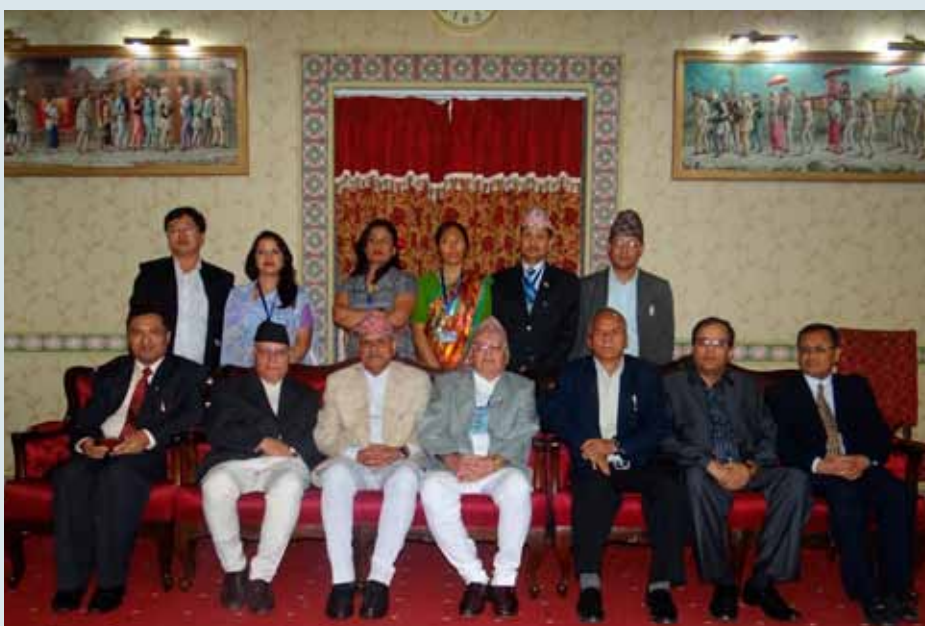
Rt. Hon. President Dr. Ram Baran Yadav along with the NHRC Chairperson and other Office Bearers during the NHRC annual report submission at the Rastrapati Bhavan, Kathmandu

KATHMANDU: The National Human Rights Commission (NHRC) submitted its annual report- 2012/13 to President Dr. Ram Baran Yadav.