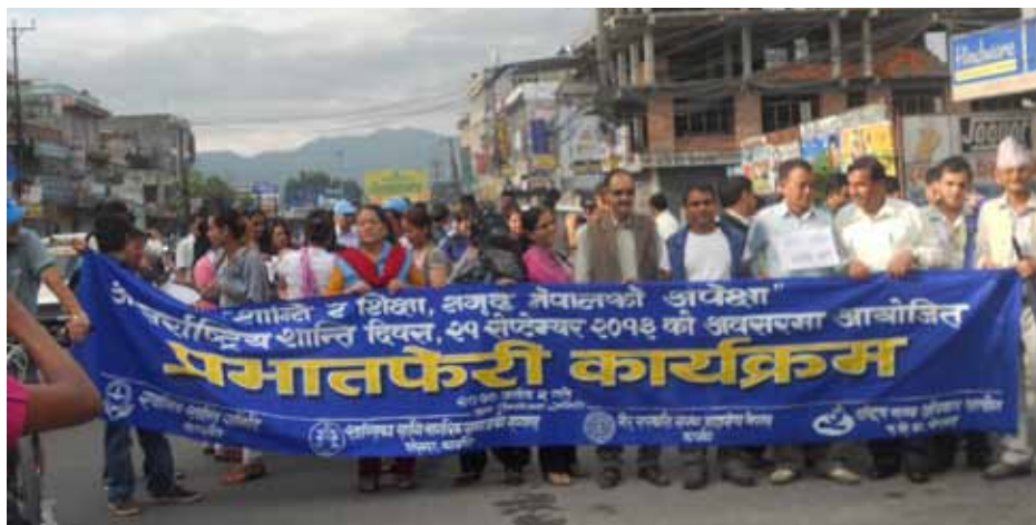
Participants representing various human rights organizations and civil society including NHRC Pokhara at a peace rally organized in Kaski on the occasion of the International Peace Day