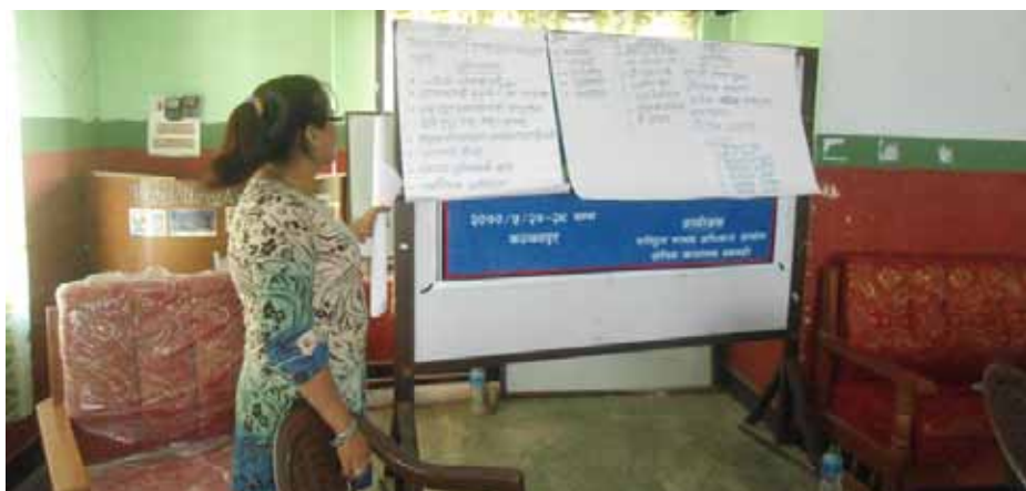
HRBA expert providing training to the representatives of the government agencies In Kailali district

KAILALI: The Declaration of the Right to Development-1986 has clearly stated the importance of various rights of people. Besides, development and human rights are indispensable to each other. Having internalized this, the far western Regional Office of the National Human Rights Commission of Dhangadhi organized three day training on the Human Rights Based Approach to Development (HRBA)