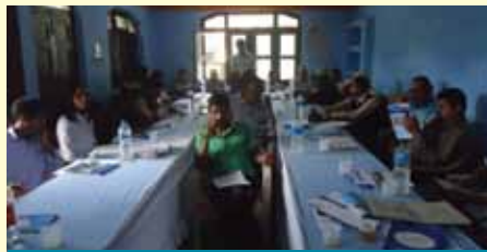
Participants at a program held on the ESC rights in Baitadi district

BAITADI: An interaction program was organized on the situation of the right to health and education in Baitadi district. The program aimed at exploring de-facto situation and prevalent challenges in realizing the right to health and education in the area. The program was participated by the chief district officer, former law maker, leaders of the local political parties, civil society representatives, NGOs and local level journalists among others.